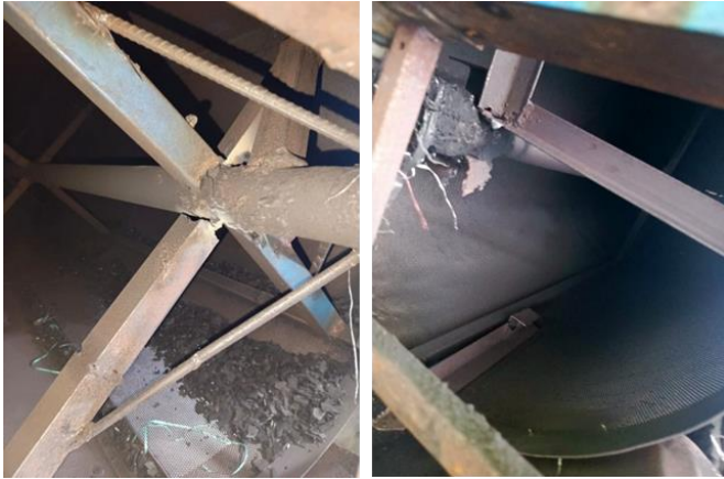
Figure 3. 1 Condition of the broken shaft support before replacement

The shaft support failure occurred as a result of inadequate weld penetration and insufficient material strength to sustain heavy loads. It is recommended to replace the shaft with a material having a diameter of 25 mm and a length of 350 mm. The additional weight of the new shaft will not significantly affect the motor's rotational speed (RPM).