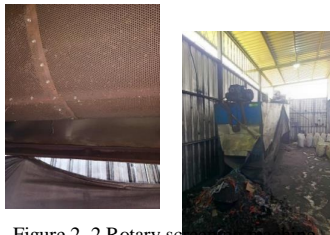
Figure 2. 2 Rotary screening machine

The rotary screening machine is used to process coconut shell charcoal, with a daily production target of approximately 4–5 tons. To prevent severe breakdowns that could disrupt production flow, a regular inspection and maintenance schedule is essential for this equipment.