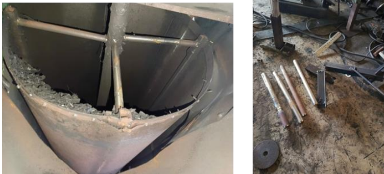
Figure 3. 2 The condition after the replacement of the shaft support component.

The shaft support failure occurred as a result of inadequate weld penetration and insufficient material strength to sustain heavy loads. It is recommended to replace the shaft with a material having a diameter of 25 mm and a length of 350 mm. The additional weight of the new shaft will not significantly affect the motor's rotational speed (RPM).