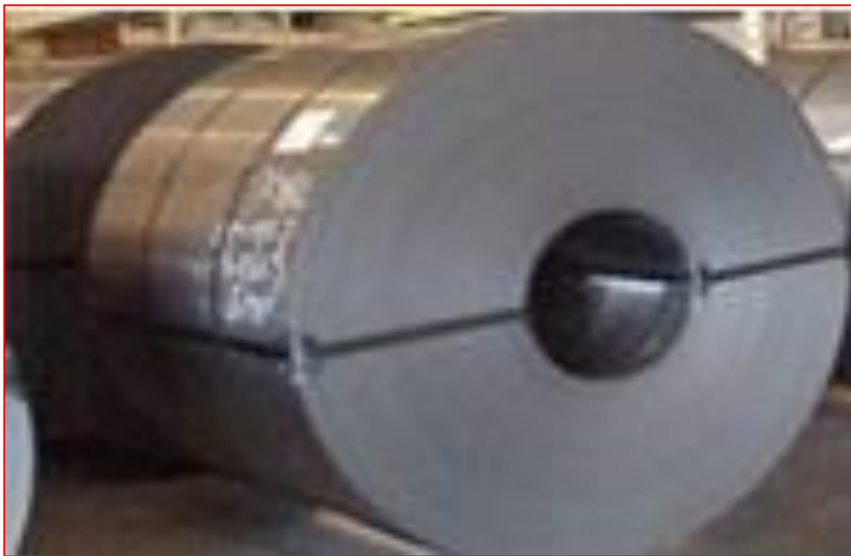
Bahan baku produksi (Coil) Hot rolled coil JIS G3131 SPHC KS (PT. Krakatau steel)