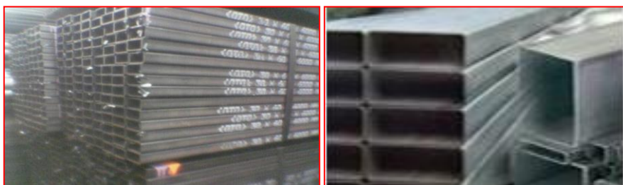
Gambar Pipa ( tube steel/pipe steel ) Square and rectangular pipe