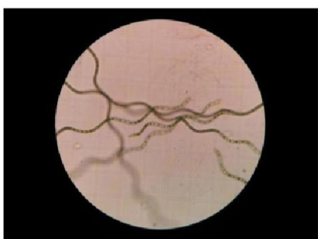
Figure 1. Spirulina sp. structure under microscope

autotroph and converted sunlight energy to chemical energy in carbohydrates form (Soni et al., 2017). This research was investigated Spirulina with blue-green helical twisting filamentous structure, as seen in Figure 1, suggesting microalgae characteristics. The Spirulina showed spherical shapes on the surface. Our results were similar to other Spirulina powder products for animal feed or functional food (Singh, 2011).