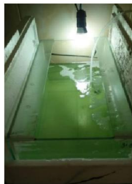
Figure 2. Spirulina culture in medium-scale

The salinity of Spirulina was maintained at 30 ppt in small-scale culture for seven days. In this cultural type, the cell density of Spirulina was significantly increased due to its favorable condition (Mahrouqi et al., 2015). The density of Spirulina was increased from 50 \times 10^3 cells \text{ml}^{-1} to 500 \times 10^3 cells \text{ml}^{-1} in seven days, as seen in figure 3a. After that, the salinity was gradually diminished every three days in medium-scale culture. Nevertheless, Spirulina 's density was slowly decreased from 270 \times 10^3 cells \text{ml}^{-1} to 160 \times 10^3 cells \text{ml}^{-1} in 25 ppt; 145 \times 10^3 cells \text{ml}^{-1} in 23 ppt; 81 \times 10^3 cells \text{ml}^{-1} in 20 ppt; and 41.8 \times 10^3 cells \text{ml}^{-1} in 15 ppt (figure 3b). The cell density of Spirulina in 15 ppt was quite unstable. Therefore mass-production was optimized in 20 ppt. In this study, although each treatment had different salinity, nevertheless the water parameter was the least different (figure 3c). For this reason, we conclude that the degradation of Spirulina 's cell density was majorly due to its reduced salinity.